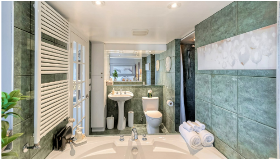
(Sihem Zellaoui, Re/Max Bonjour)